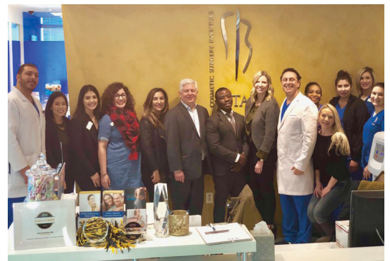
Photo: ASAPS candidates visit Bitar Institute for interviews

The Bitar Cosmetic Surgery Institute is the only practice in the DC area to have earned this distinguished endorsement.