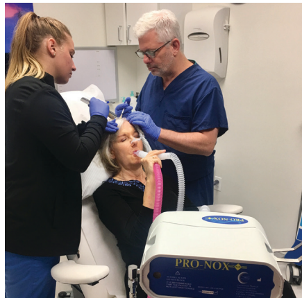
Photo: Dr. Lickstein utilizing Pro-Nox™ to enhance the patients comfort during PRP for Hair Loss

Coming for a treatment? Ask our staff of Pro-Nox™ will help with your next treatment.