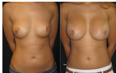
Actual Patient of Bitar Institute Transaxillary Breast Augmentation

are: a smaller incision, reduced risk of infection, less damage to the implant, reduced risk of tissue damage, and faster healing. This approach to breast augmentation is simple, straight forward, and yields excellent results with a hidden scar!