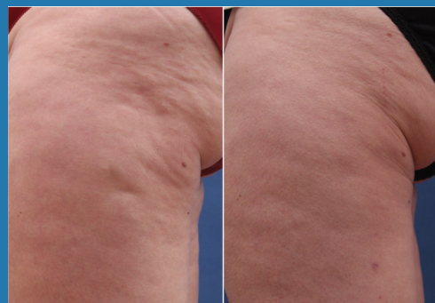
CelluSmooth Results