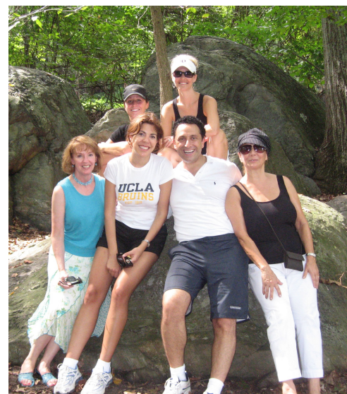
BCSI Staff enjoyed their annual picnic at Great Falls Park recently