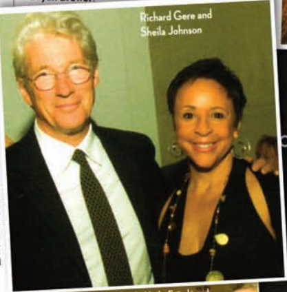
Richard Gere and Sheila Johnson